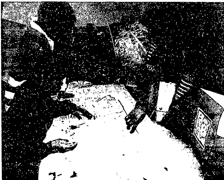
Three students use a handmade map to practice locating important sites in their school district.

youngsters to develop their own. Permit students who enjoy patterned learning and routines to use PLS often. They provide structure for those who need it and permit youngsters to work alone, in a pair, or with a small group. PLS should begin with a story or anecdote and include many illustrations and built-in tactual activities for reinforcement. Anticipate that PLS will be most effective with students who need structure and enjoy repetition.