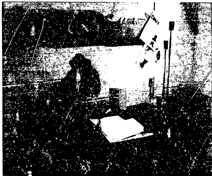
Bright areas and softly lit areas have been created in this junior high school classroom.