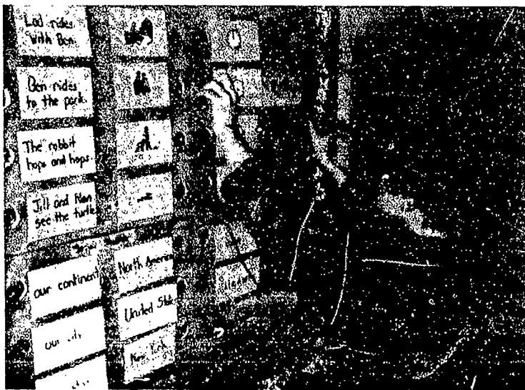
A tactile/visual learner uses an electroboard to correctly match sentences to the pictures they describe.

Underachievers tend to have poor auditory memory, although short auditory explanations may be used to reinforce new information. Underachieving visual learners tend to learn best through pictures, drawings, graphs, symbols, and cartoons, rather than print. Although they often want to do well in school, many children's inability to remember facts taught through lecture, discussion, or reading often contributes to their becoming underachievers in conventional schools.